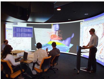
Note: These images are a vision of the future WRSC, not of the tools that will be provided at the Prototype Event.

2. With your help, we want to design the prototype facility for the World Resources Simulation Center as a place where thoughtful people work to design a sustainable world for all in the shortest possible time. With your collective expertise, we want to catalyze the development and realization of the optimal visualization-simulation center.